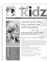
Squarefold Trim Booklet