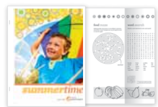
Colour Inserts, Staple and Engineering Z-Fold