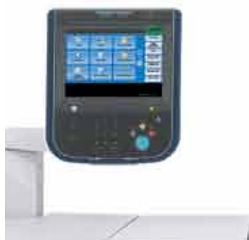
Integrated Copy/Print Server