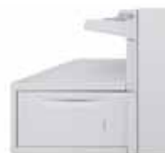
A3 High Capacity Feeder 2,000 sheets: Up to SRA3