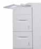
A4 High Capacity Feeder 2,000 sheets each tray (4,000 sheets total): A4-size