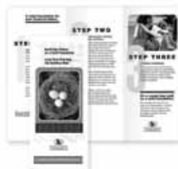
Bi-Fold, C-Fold, Z-Fold