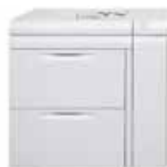
High Capacity Feeder C2-DS 2,000 sheets each tray (4,000 sheets total): Up to SRA3