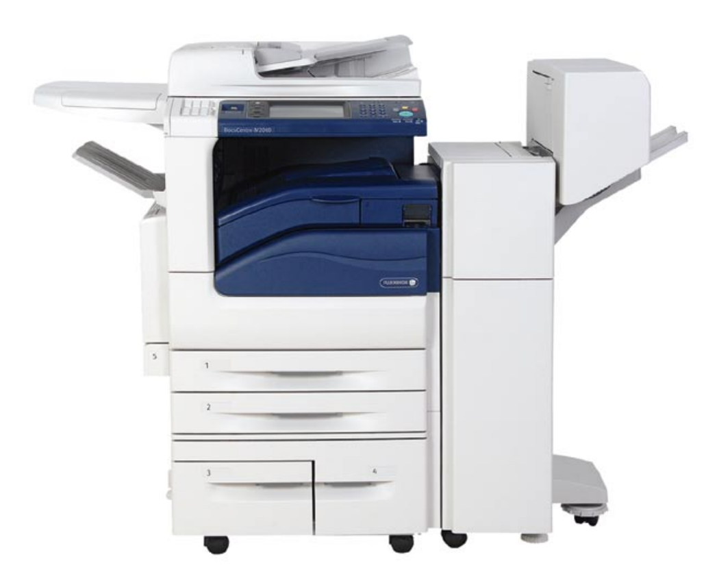
DocuCentre-IV 2060 with optional Wing Table, High Capacity Tandem Trays and Booklet Finisher